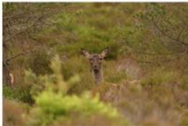
Organisations and individuals have come together to form an accord relating to issues in deer management.

Initiated by the Association of Deer Management Groups and Scottish Environment LINK, The Common Ground Forum (CGF) includes deer stalkers, foresters, farmers, landowners, community representatives, nature conservationists and many others.