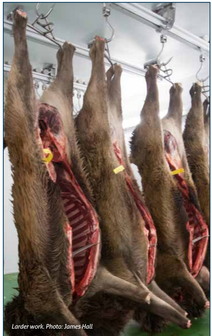
Larder work.

Linked with this demonstration of knowledge and competence is the recommendation that all stalkers should maintain ongoing training to ensure that they are able to demonstrate current knowledge and understanding of best practice and food safety. This can be achieved through Best Practice due to be reinstated during 2017, or through a readily accessible food safety course that can be completed on line via a range of suppliers at little cost. Continuous professional development is a requirement of many aspects of our lives, and there should be no compelling reason why this is not adopted by the wild game sector, demonstrating our ongoing commitment to best practice and quality.