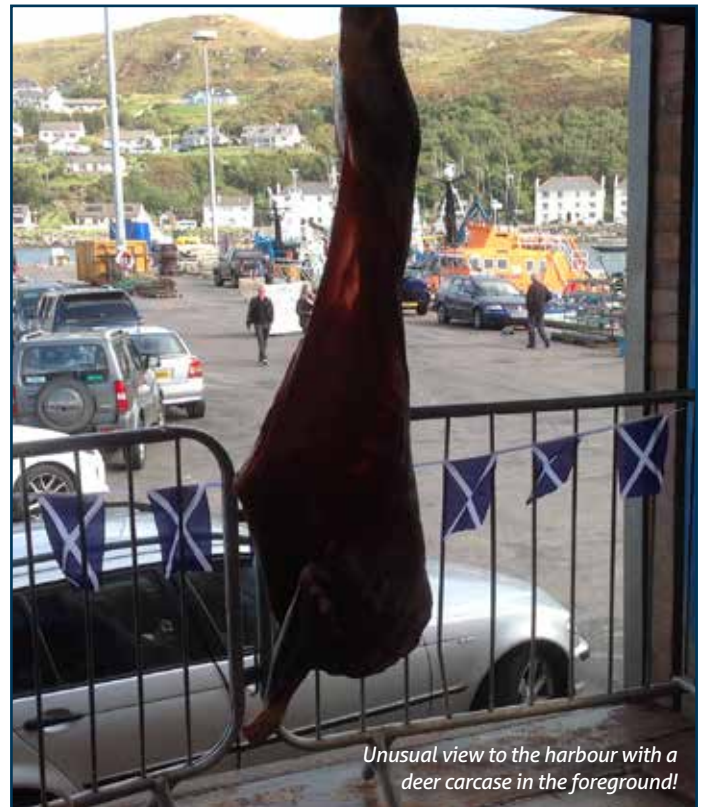
Unusual view to the harbour with a deer carcass in the foreground!

We do know that the Small Business Bonus Scheme will apply (100 per cent relief for RVs up to £15,000, 25 per cent to £18,000) but other business rateable enterprises (eg self catering or renewables) will be added to sporting rights assessments in respect of these reliefs. There is a right of appeal for 6 months after an assessment is issued and ADMG's advice at this stage is that all assessments should be appealed, at least until a clearer picture emerges.