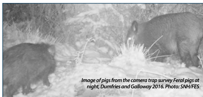
Image of pigs from the camera trap survey Feral pigs at night, Dumfries and Galloway 2016.

Recent surveys indicate the feral pig density is still low in Scotland and that we could control their populations if land managers act promptly. But if these populations are allowed to grow unchecked, their rooting behaviour could become a major threat to agricultural productivity, and their presence could undermine efforts to control an outbreak of animal disease. At low densities feral pigs can benefit the natural heritage helping to speed nutrient cycling and break up dense turf to encourage woodland regeneration but at higher densities they can damage vulnerable species (including some nesting birds, invertebrates and plants).