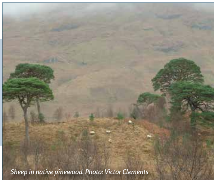
Sheep in native pinewood.