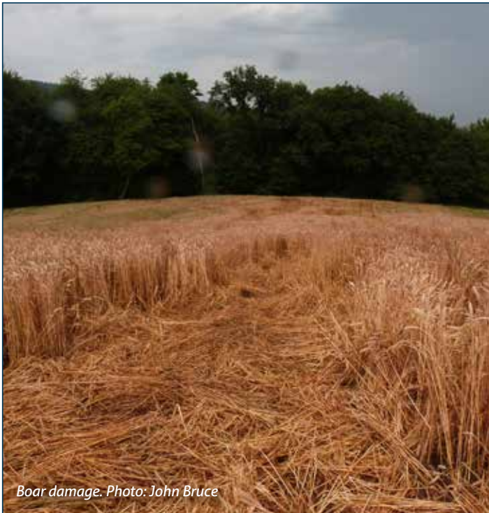
Boar damage.

The revier, the leased area, will have been let with a certain expectation of game. There used to be elaborate Abschussplan, denoting the quarry species, class, sex and age, detailed by the administration office. This would be adhered to, on paper anyway, and by exhibiting the Streckenliste, the returns. However, these top down orders have been softened increasingly recently due to administration costs and also because they didn't actually achieve very much.