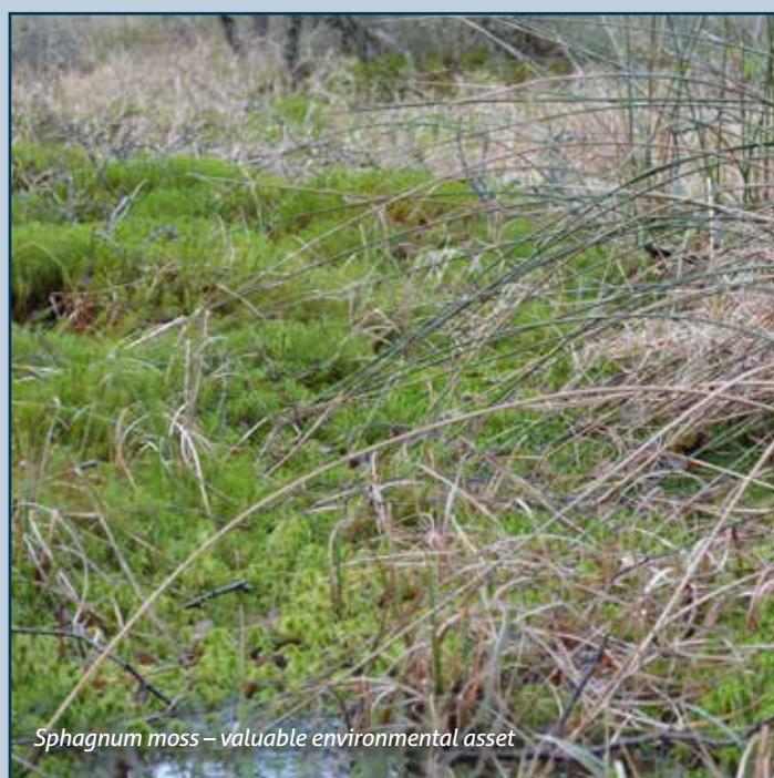
Sphagnum moss – valuable environmental asset

We do not have the answers at this stage, and research is needed to show what damage trampling can cause to peat bogs and how much this can hamper regeneration efforts. Such additional pressure may affect the ability of peatland already damaged through, for example, historic burning or overgrazing, to fully recover its living sphagnum acrotelm - compromising the bog’s abilities as a carbon sink.