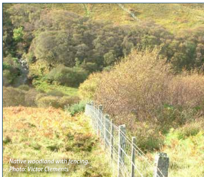
Native woodland with fencing.