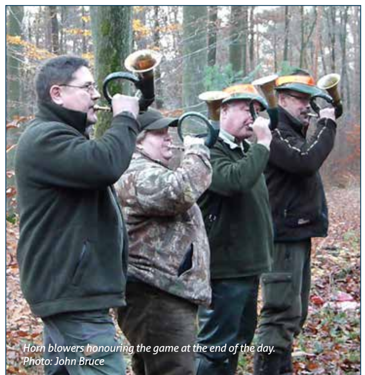
Horn blowers honouring the game at the end of the day.

In summary, the hunting fraternity of Germany is a well organised, careful and considerate, proud and well-informed group of people who engage in the countryside to a considerable degree, and who nurture their quarry species just as we do. They have a great respect for their quarry and other species, as we do, and are fortunate to enjoy a landscape of great variance in topography and climate; from the Alps to the sea and from Chamois to sea gulls.