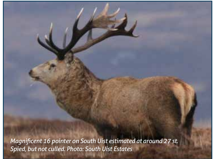
Magnificent 16 pointer on South Uist estimated at around 27 st. Spied, but not culled.

Jim Grant at Glenbancher Estate, Newtonmore, noted a good rut, but slow to start, with lots of roaring and chasing and