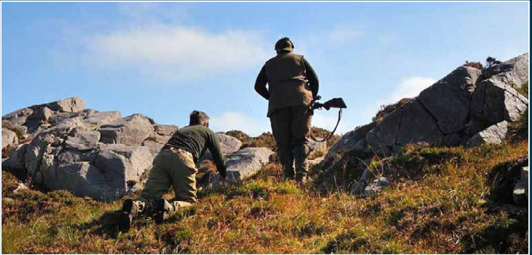
One last look - Ardfin, Jura

Review produced by The Association of Deer Management Groups Tel: 01397 702 433 www.deer-management.co.uk